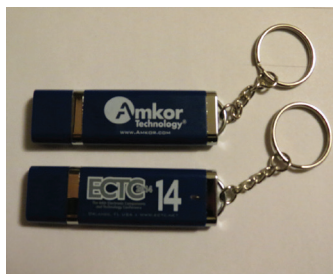
Proceedings on Thumb Drive