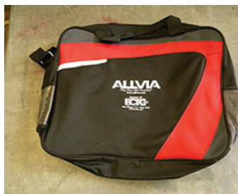
Tote Bag Sponsorship