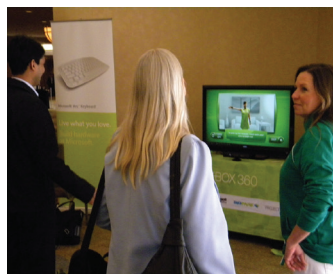
Special Sponsorship Opportunities Available